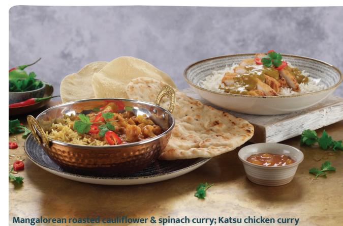
Mangalorean roasted cauliflower & spinach curry; Katsu chicken curry