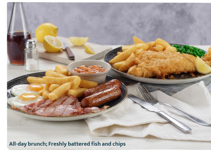
All-day brunch; Freshly battered fish and chips

The cod and haddock we serve come from fisheries which have been independently certified to the MSC's standards for well-managed and sustainable fisheries.