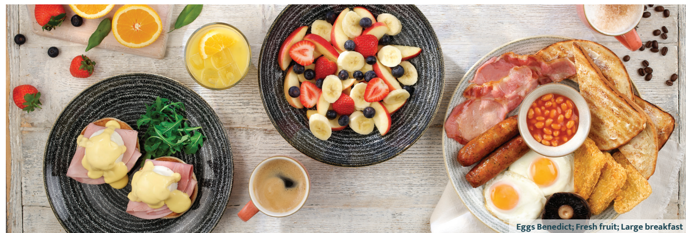
Eggs Benedict; Fresh fruit; Large breakfast