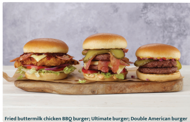
Fried buttermilk chicken BBQ burger; Ultimate burger; Double American burger